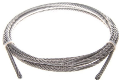
Steel cable 5mm