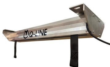
Electric Lift 100