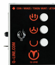
Coin device 230 € 1