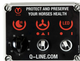
Control MT IR AB L 230