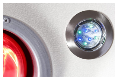
9 RGB LED