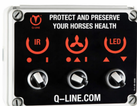
Control CB IR AB L 230