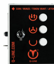
Coin device 230 € 1