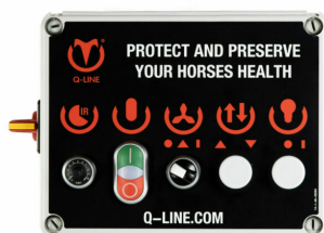
Control ET-IR AB 230