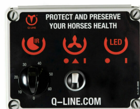
Control MT IR AB 230