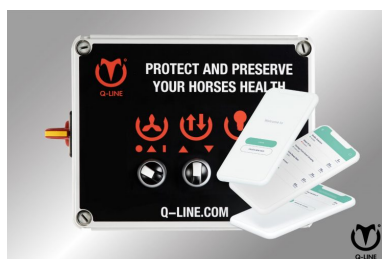
Pay with app 230