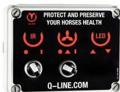
Control CB IR AB 230