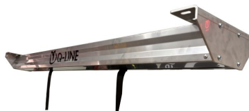
Electric Lift 170