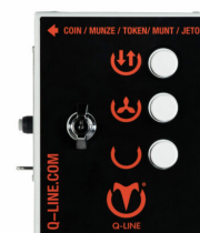
Coin device 230 € 1