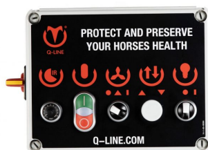
Control ET-IR AB, L 230