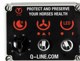
Control MT IR AB L 230