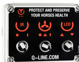
Control CB IR AB L 230