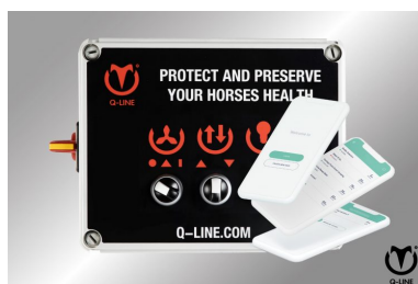
Pay with app 230