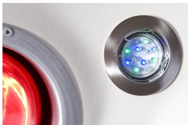
9 RGB LED