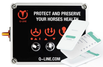
Pay with app 400