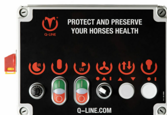
Control ET-IR UV AB 400