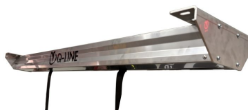
Electric Lift 170