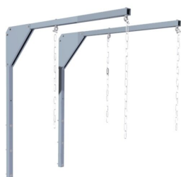
Angled support zinc