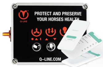
Pay with app 400