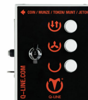
Coin device 400 € 1