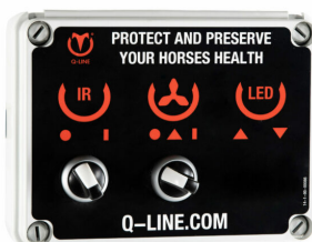
Control CB IR AB 400