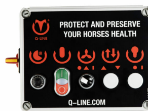
Control ET-IR AB 400