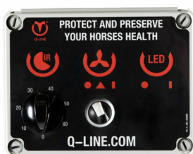
Control MT IR AB 400