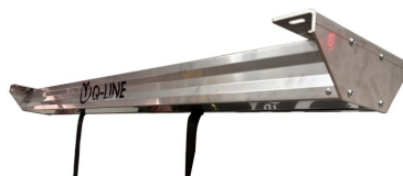
Electric Lift 170 Heavy Duty