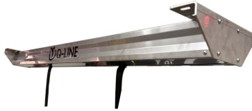
Electric Lift 170 Heavy Duty