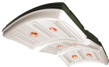
Image not found Additional lighting