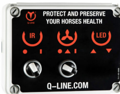
Image not found Including cables