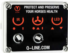
Image not found Including cables