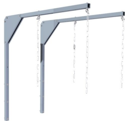
Image not found Maximum freedom of movement