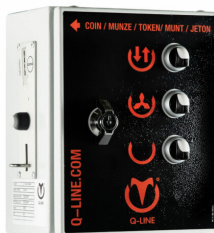
Image not found Compact design