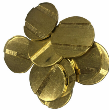
Profile token 27 mm