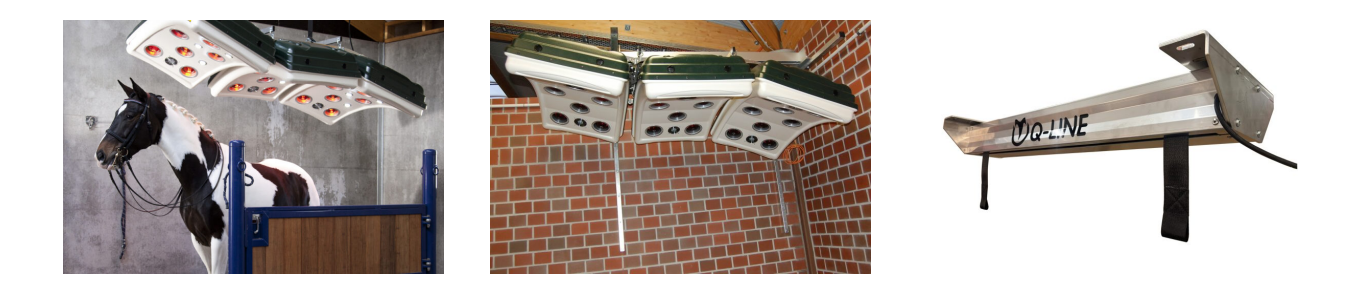
SAFETY WALL WALKER