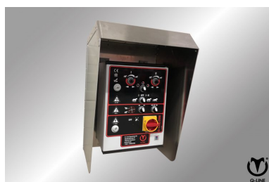
Control box cover