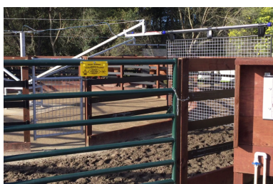
Track irrigation Basic