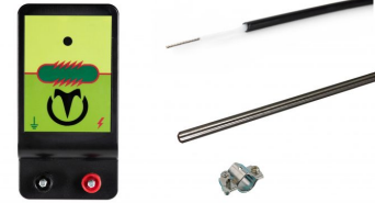
Shock device set Basic 230