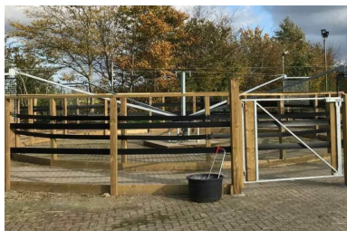
Basic fencing 15,8 mtr