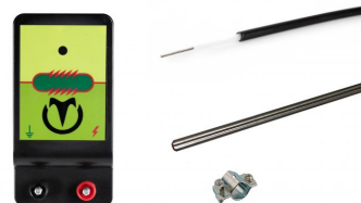
Shock device set Basic 230