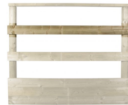
Plank 16 meter walker