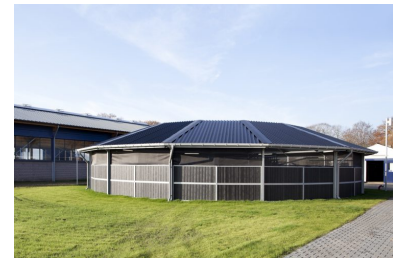
Passage 18 meters 750N