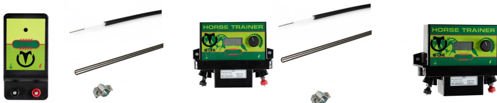
Image not found Dutch manufacture