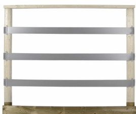
Plank 15,8 mtr