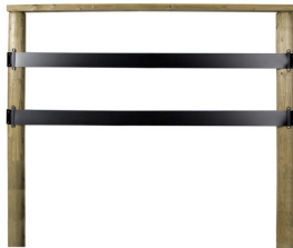
Image not found Horse friendly