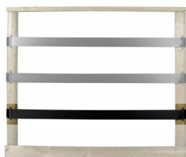
Band 15,8 mtr