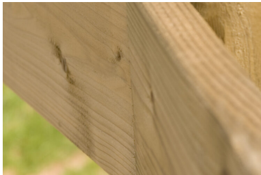
Image not found Pressure treated