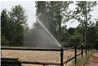
Image not found Improved waste water tolerance

Image not found Nozzles fully adjustable 50-360 degrees