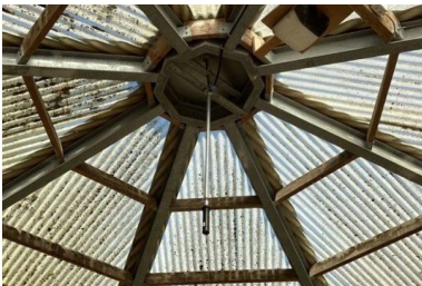
Image not found Safe and dust-free environment