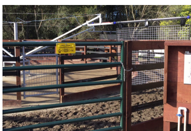
Track irrigation Basic