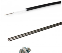
Shock device set Basic 230