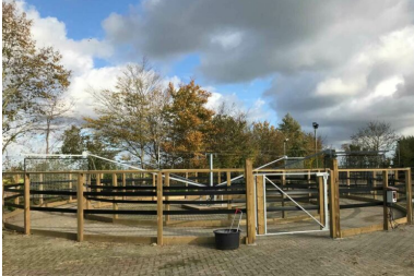
Basic XL fencing 18,6 mtr