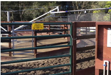
Track irrigation Basic