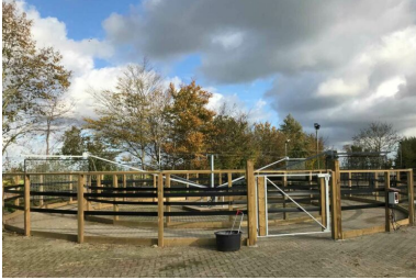
Basic XL fencing 18,6 mtr