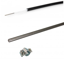
Shock device set Basic 230