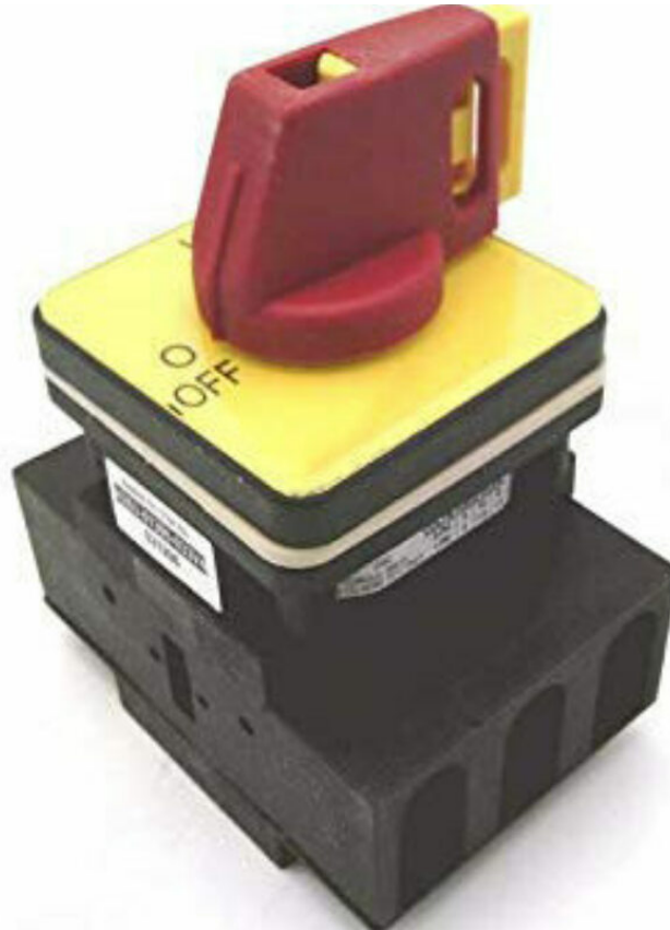
Load switch, main / emergency-off switch, front mounting, 20A, 3-pole, 4-hole mounting 36 x 36 mm, V-button, yellow / red

Main / Emergency Stop V 3P / Article no. 08-1-00-00243