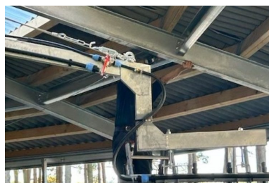
Lunging irrigation on 1 arm