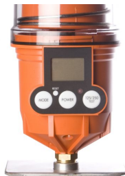
USD Lubrication System Sublime