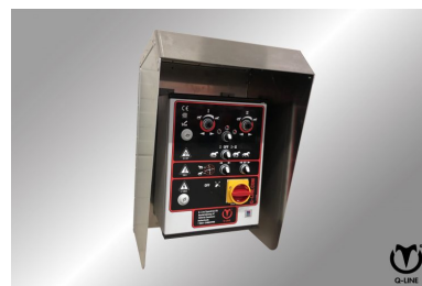
Control box cover