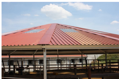
Dome 18 meter 1500N