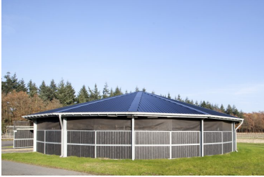
Dome 20 meter 1500N