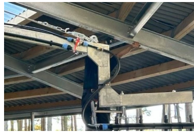
Lunging irrigation on 1 arm