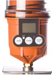
USD Lubrication System Sublime