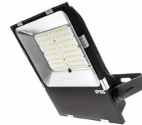
LED flood lamp 150W Sublime