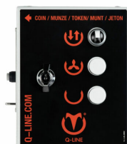
Electrical Lift control