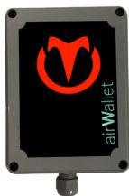
Image not found Location-Independent Booking