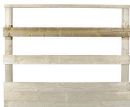
Plank 18 meter walker