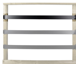
Band 25 meter walker