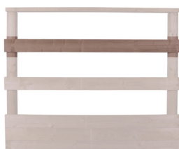
Plank 25 meter walker