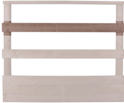
Plank 25 meter walker