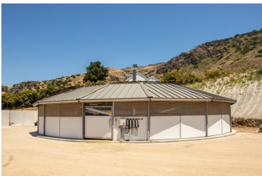
Image not found Reinforced footplates