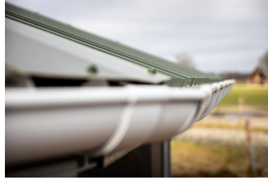
Rain gutter 11 sections