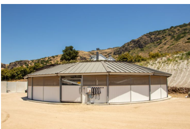
Image not found Reinforced footplates