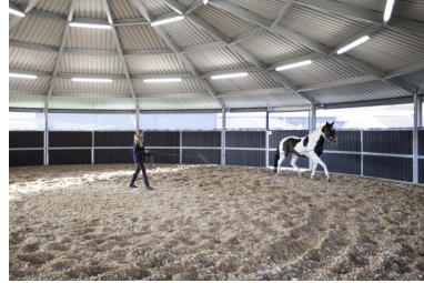
Lunging fence for a 18-meter roof