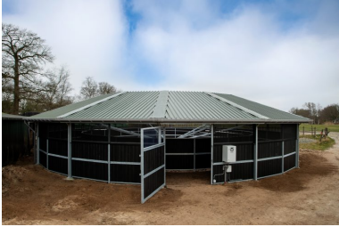
Fencing for a 18-meter roof