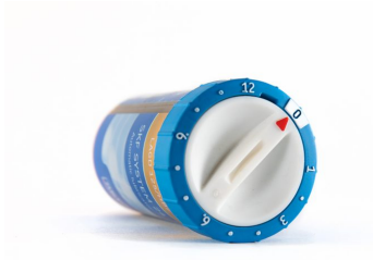
Image not found No chemical waste