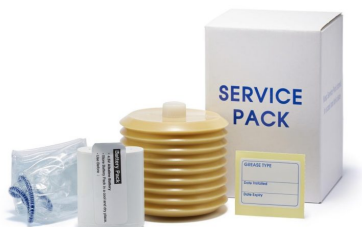
USD service pack