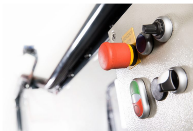
Image not found 230V/2,2Kw