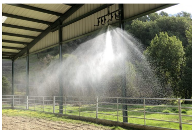
Image not found Can be used anywhere

Image not found Perfect water distribution