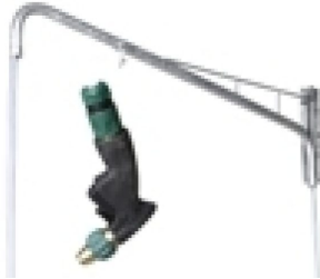
Image not found Easy to assemble unknown