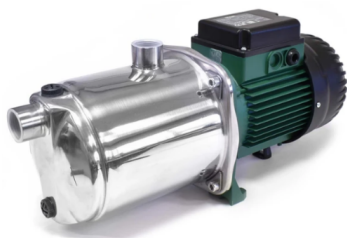
Pump set Sublime