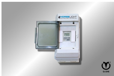
Horse Light Controller 1200W