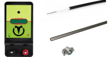
Shock device set Basic 230