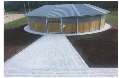
Passage 12 meters 750N