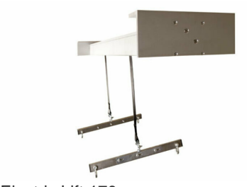
Electric Lift 170