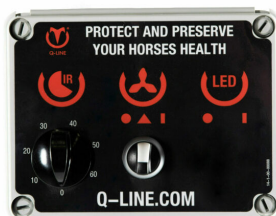
Control MT IR AB 230