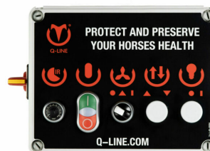
Control ET-IR AB 230