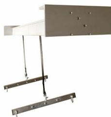
Electric Lift 170 Heavy Duty