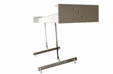
Electric Lift 170 Heavy Duty