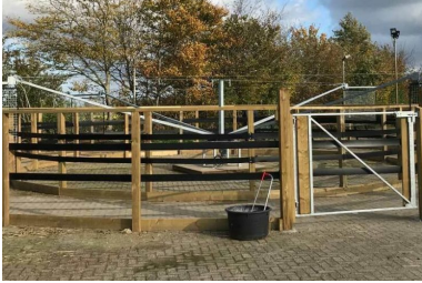
Basic fencing 15,8 mtr