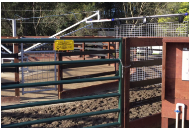
Track irrigation Basic