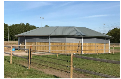
Passage 15 meters 750N