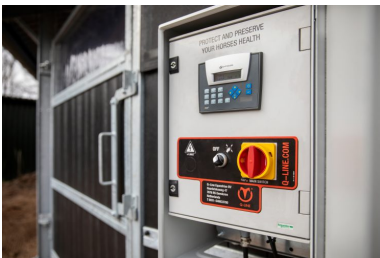
Programmable box 230V- 0,75KW