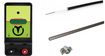
Shock device set Basic 230