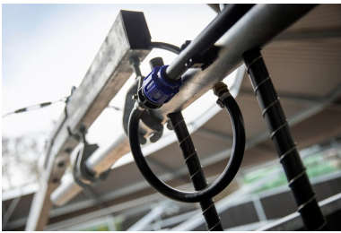
Track irrigation Sublime