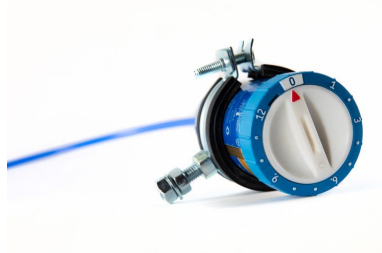
Lubrication system 12 months