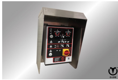
Control box cover