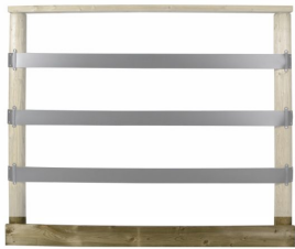
Plank 18,6 mtr