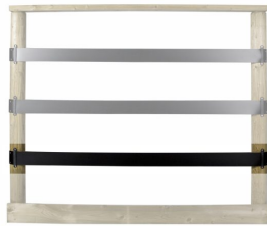
Band 18,6 mtr